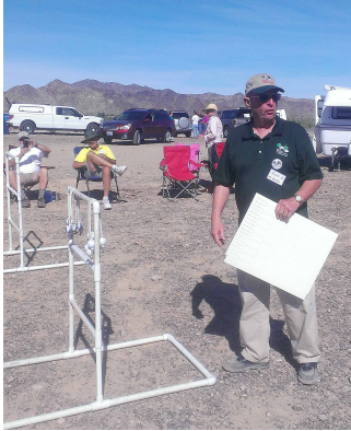
Let the action begin

Once again, they say a picture is worth a thousand words, so let me save several thousand words my showing you some pictures!