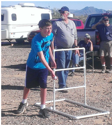
The kid is going to show you how to do it!