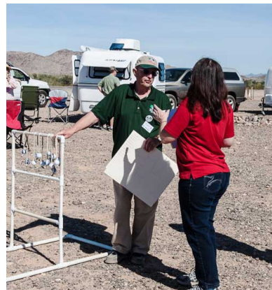
OK this is how you do it!