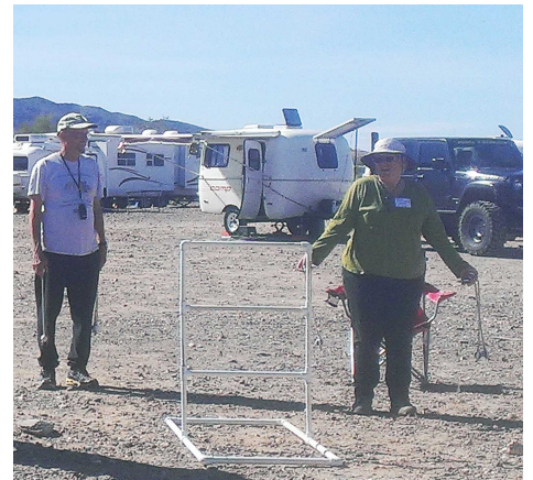
Oh, that's how you do it!