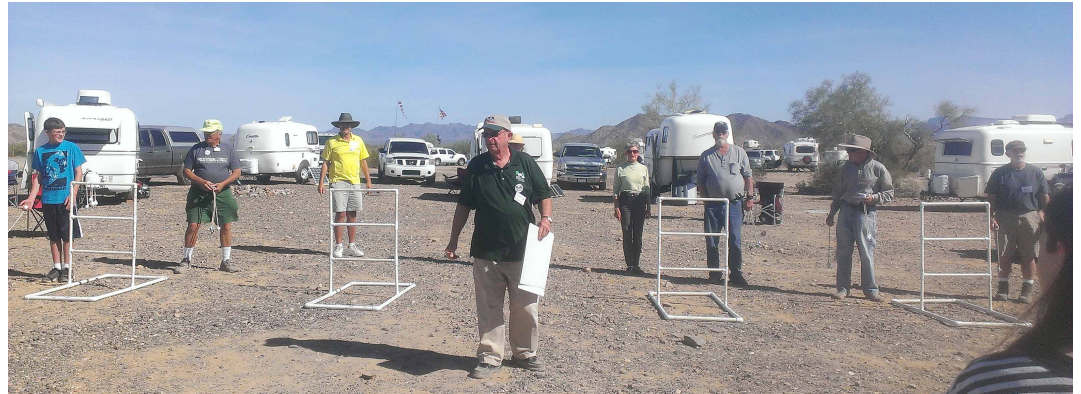
Yours truly tried to keep the decorum on a civilized level.