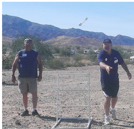
Here, let me try.