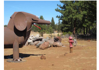
Oh boy! A fire hydrant