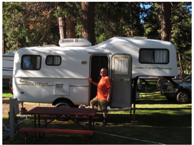
Earl and The Peanut