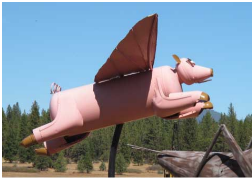
Can pigs fly?

Could it be art? Perhaps! Could it be junk? Nah -- I don't think so. Someone in our group suggested I might call it "junque". It was probably made out of recycled junk! I walked among the metal sculptures fascinated at what I was seeing!