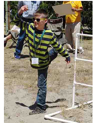
This is another way to do it