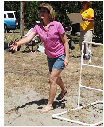
Show us again how you do it?