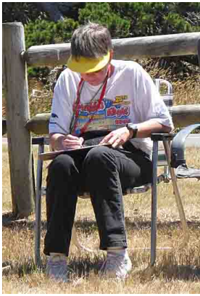
Score keeper hard at work