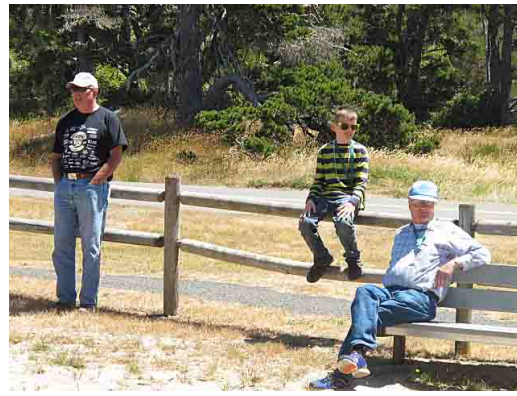
The object of the game is to score points by hitting the ladder - 3 points for top rung, 2 points for middle rung, and 1 point for the bottom rung.