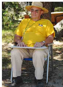
Taking a "breather"