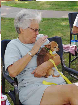
Baby sitter in action