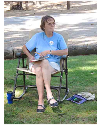
The ever vigilant scorekeepers