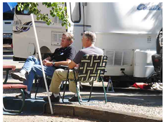
Not much going on!