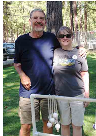
The tournament provided the exercise for the day.