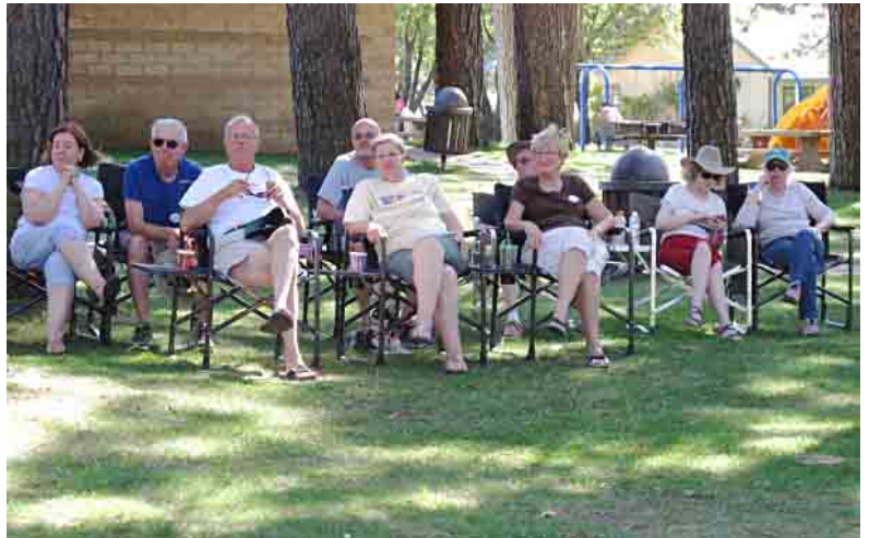
The cheering section