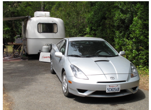
You mean you pull that 13' Scamp with this?