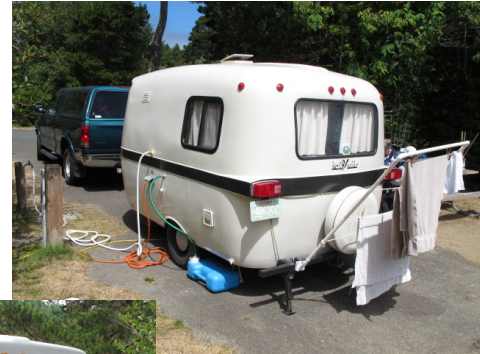
vintage Trail Mite