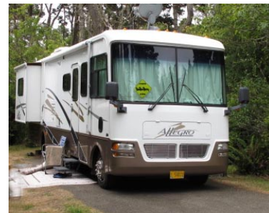
Ooops!!! Who let that big stickie in?