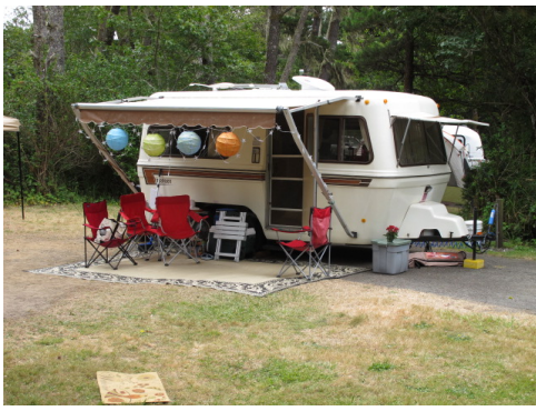
Another Big Foot