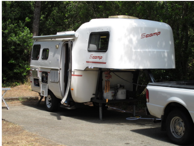
Scamp 5er 19' This trailer has had considerable modifications