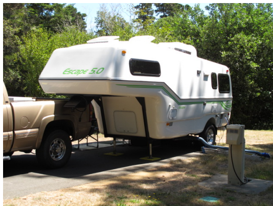
Escape 5th wheel