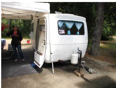
This little vintage egg was a complete mess and now being completely restored using a few modern conveniences such as A/C.