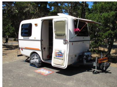
A newer Trillium