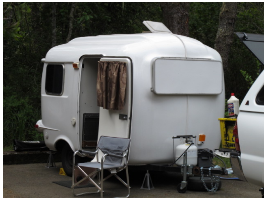
A vintage Burro that has been restored