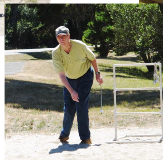
The tournament chair keeps track of the scores