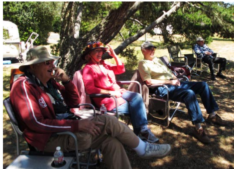
The cheering section